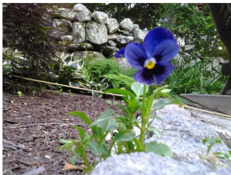
Service (planting the seed) - Recovery blooms.

Alternate Area Delegate - The Delegate attends the annual Al-Anon/Alateen World Service Conference (our world-wide group conscience) and brings to the Conference our Area's viewpoint on matters affecting the entire fellowship. The Delegate then returns to the Area with a broader perspective of Al-Anon worldwide. He/she is the bridge of understanding that links the groups in the Area with world Al-Anon/Alateen to help us continue to function in unity. The Delegate is the servant of Al-Anon as a whole.